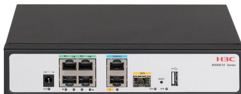
H3C MSR610 router

The MSR600 series can be deployed as an egress router for small- to medium-sized enterprise networks to operate with VPN, NAT, and IPSec service gateways. Together with other H3C products, the MSR600 series can provide comprehensive network solutions for government, power, financial, tax, public security, railway, and education customers.